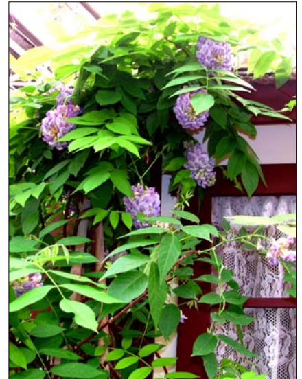
A great alternative- American Wisteria

The Management List consists of over 70 invasive plants. Although not as highly invasive as plants on the Do Not Sell List, it is recommended that these plants are not planted on Long Island, especially by county agencies or for homes near natural habitats. Species on the Management List are "moderately invasive" according to the independent scientific review committee.